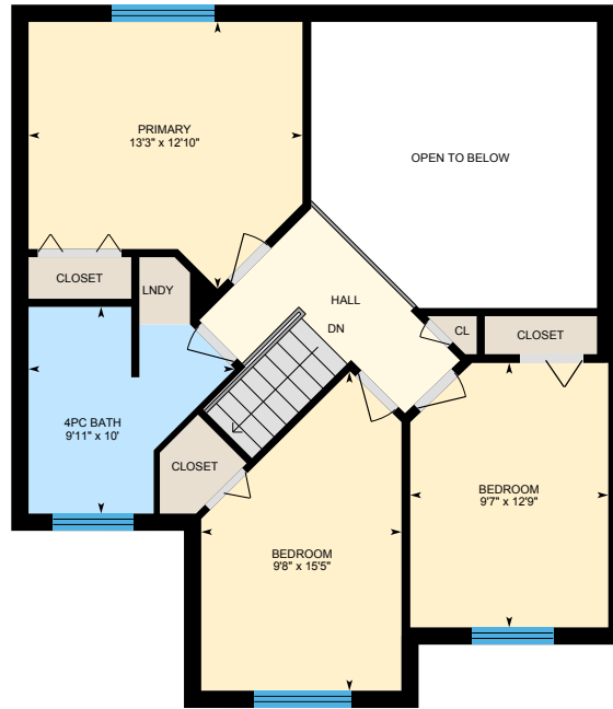
2nd Floor Exterior Area 717.81 sq ft